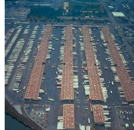
▲ Siplast Lightweight Insulating Concrete and over 7,000 squares of torch grade Paradiene work as a complete system to protect this fruit and vegetable market in the Bronx.