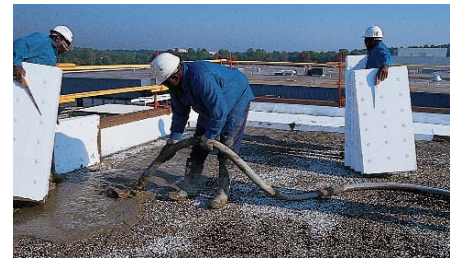
▲ Decreasing thicknesses of Insulperm Insulation Board form the slope-to-drain contour of the finished system.