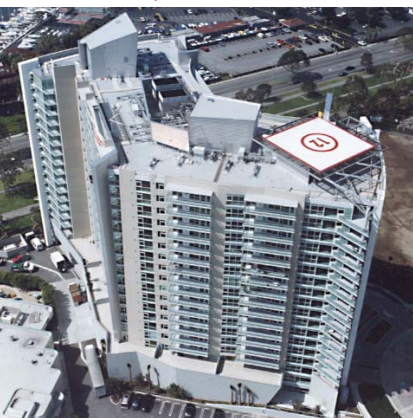
This high-rise luxury condominium tower on the beach at Marina Del Rey, California is protected by a complete Siplast System of torch grade Paradiene and Siplast Lightweight Insulating Concrete.