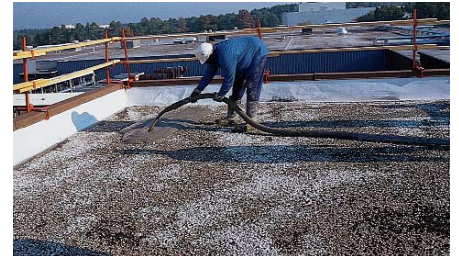
▲ On this reroofing project, a thin slurry coat of lightweight insulating concrete is poured in place, correcting substrate irregularities and bonding the Insulperm Insulation Board to the substrate.

Fire resistance, durability, high compressive strength, and excellent resistance to moisture and heat flow are important characteristics of quality roof insulations. In addition to these characteristics, Siplast Lightweight Insulating Concretes offer many unique advantages that make them superior to ordinary rigid board insulation.