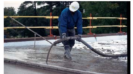
▲ A top layer of insulating concrete is placed over the Insulperm, filling the holes in the Insulperm and locking it into the system without the use of fasteners.