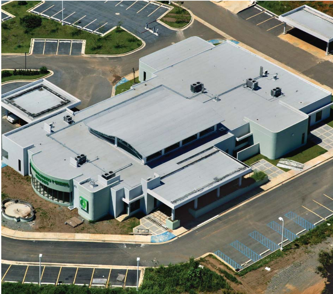
▲ The Insulcel-RT Lightweight Insulating Concrete System and a Paradiene 20 TS/ 30 TG Roof Membrane System were chosen for this bank in Puerto Rico.