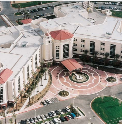
▲ A Siplast Lightweight Insulating Concrete System and Paradiene 20/30 FR Roof System were installed on this Nevada hospital.