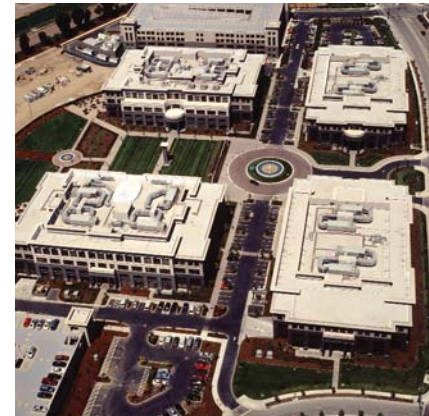
▲ This impressive complex in northern California is protected by a Paradiene 20/30 System installed over Siplast Lightweight Insulating Concrete.

The Insulcel mix is a combination of Insulcel-PB pregenerated cellular foam with a Portland cement/water slurry. The result is an economical roof insulation system appropriate for jobs located in climates that are conducive to proper curing of cellular concrete. Insulcel Insulating Concrete is placed at a minimum 2-inch thickness over the top of the Insulperm Insulation Board.