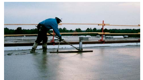
▲ Siplast Lightweight Insulating Concrete is screeded to a smooth, durable, monolithic surface ideal for roofing application.